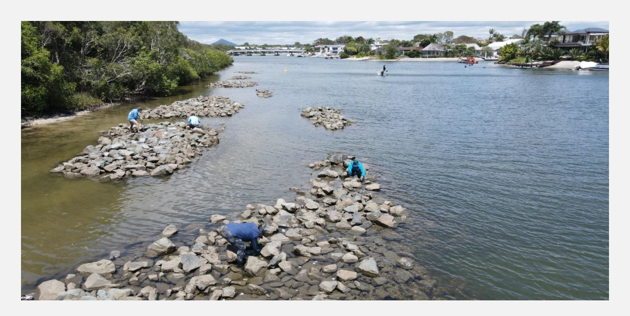
Figure 6 – Volunteers assist TNC with seeding the reef patches at Noosa Sound West restoration site

Reef seeding with seeded oyster cultch (oysters set on oyster shells and placed into voids of the reef) has been undertaken successfully on all reef patches with great local support. Thanks to Noosa Council, Noosa Integrated Catchment Association and the Department of Fisheries who provided strong support.