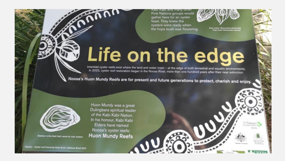
Figure 8 – One of three signs celebrating the Huon Mundy Reefs at Kabi Kabi connections to the Noosa River

TNC has worked with Kabi Kabi elders and Noosa Council to install three interpretive signs, one each near to the Tewantin, Noosa Sound East and Noosa Sound West sites.