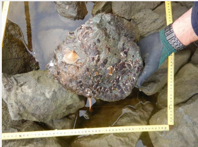
Figures 1 and 2 - Oyster density at Goat Island and at Noosa Sound East