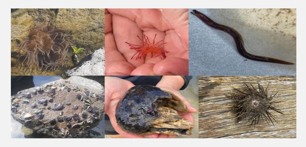
Figure 4 - A variety of life is already appearing on the and within the oyster reefs