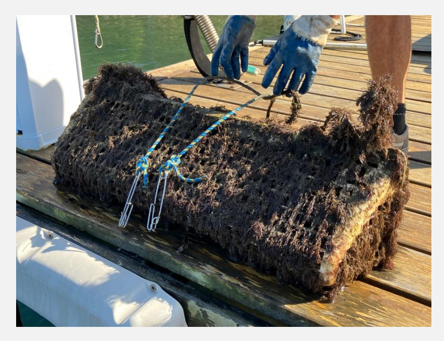
Figure 9 – An oyster garden ready for cleaning

Oyster gardening is continuing its success around the river under the dedicated project management of the Noosa Integrated Catchment Association (NICA) (Figure 9). Richard and his team have been out maintaining baskets, sharing information through an oyster masterclass, and providing baskets to the schools' programs. There are plenty of oysters inhabiting the baskets including all 3 species of rock oyster, 3 species of pearl oyster, many crabs and shrimp, fish such as stripeys, gobies and gudgeons, and numerous invertebrates such as ascidians, nudibranchs, and tunicates.