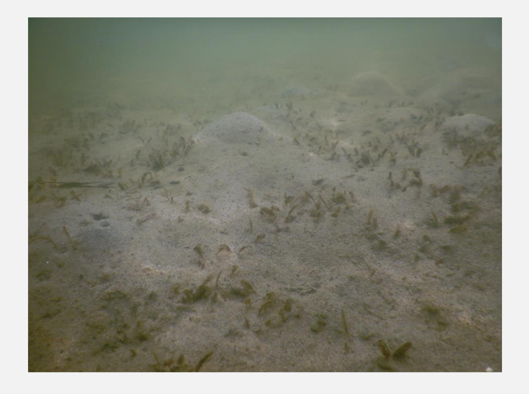
Figure 5 - Sparse seagrass ( Halophila ovalis ) growing between reef patches at Noosa Sound East

In March 2023, patches of seagrass (Halophila ovalis) were recorded between several of the reef patches at Noosa Sound East (Figure 2). The existing marine plants have remained at a similar extent at each of the sites; however, in most restoration areas there has been settlement of red mangrove propagules on the tops of the reef patches. Over time we expect that these mangroves may become established on the reefs which would further stabilise the rock substrate.